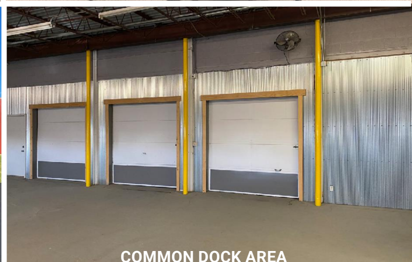
COMMON DOCK AREA