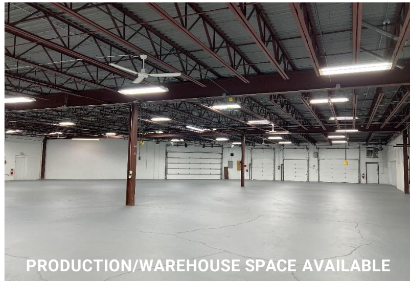
PRODUCTION/WAREHOUSE SPACE AVAILABLE