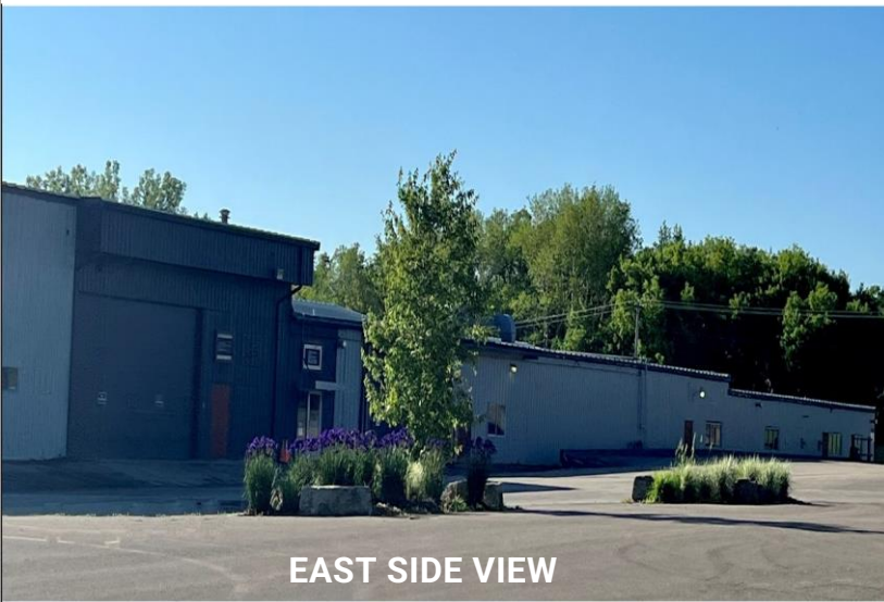
EAST SIDE VIEW