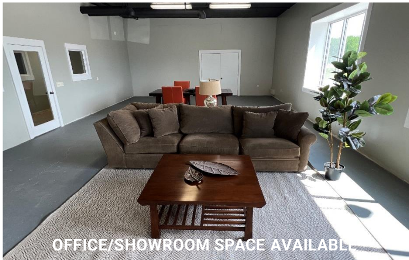
OFFICE/SHOWROOM SPACE AVAILABLE