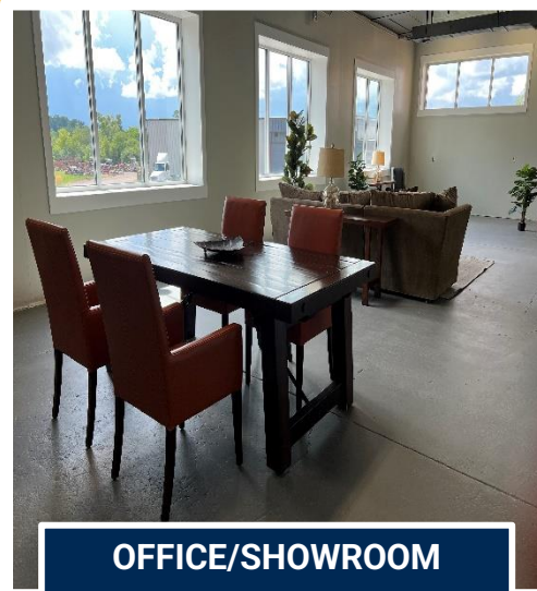
OFFICE/SHOWROOM 1ST LEVEL

Baldwin East is a 12 ½ acre Commercial and Light Industrial Park located just a short distance from I-94 in Baldwin, Wisconsin. The property consists of the former Dairyland Power Building, which is a Multi-Tenant 40,000 SF Building, along with a 60,000 SF Multi-Tenant Office/Warehouse Building.