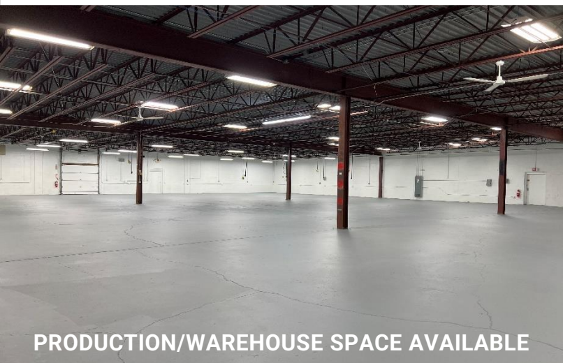
PRODUCTION/WAREHOUSE SPACE AVAILABLE